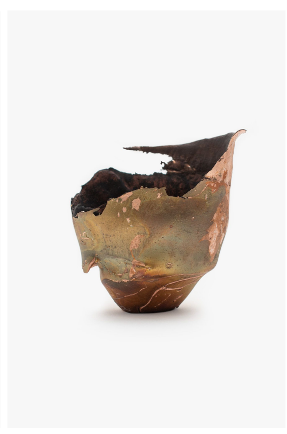
113 by Omer Arbel, to be exhibited at Victoria & Albert Museum, during London Design Festival, 17-25 September 2022

#LDF22 #omerarbel @bocci @omerarbeloffice