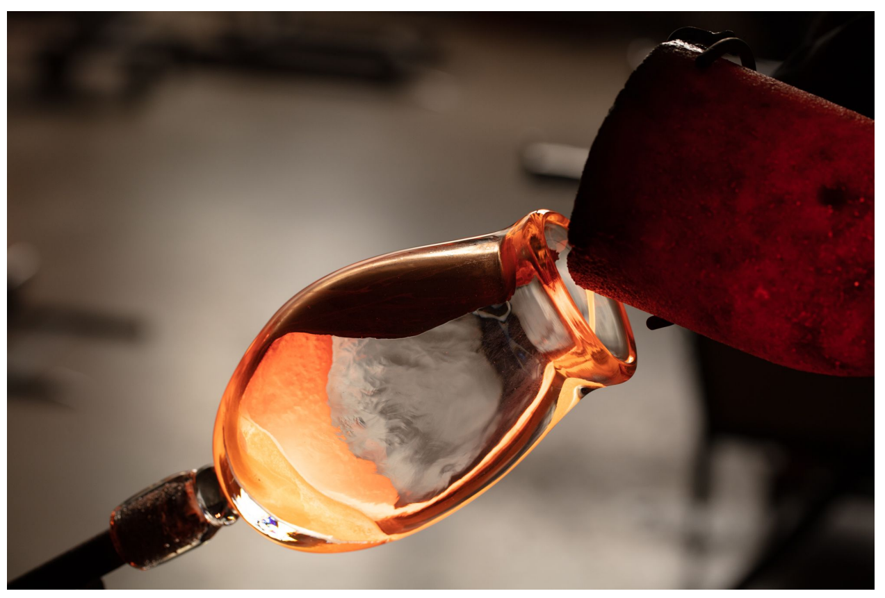
Live glass-blowing demonstration to be held at Victoria & Albert Museum, during London Design Festival, 17-25 September 2022

These works demonstrate Arbel's signature process, which is to let the intrinsic properties of a given material suggest its form, rather than impose an external idea of form upon the material. What remains of 113 are the shattered fragments of glass, and the delicate beauty of wafer-thin, fragile sculpture, like an archaeological artefact.